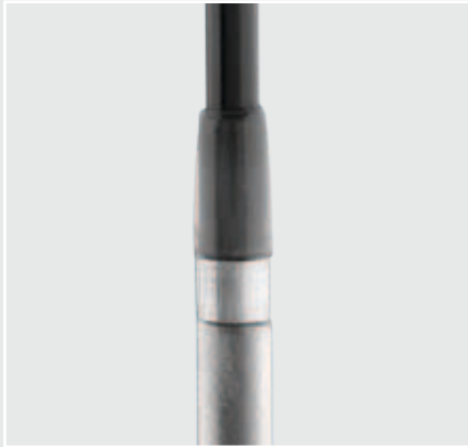
Enlarged view of the distal tip.