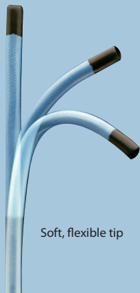
Soft, flexible tip