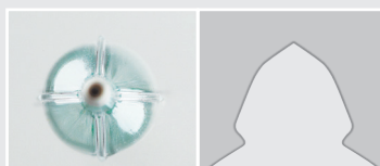
Single extrusion element

Intended for percutaneous transluminal angioplasty of lesions in peripheral arteries including iliac, renal, popliteal, infrapopliteal, femoral and iliofemoral, as well as obstructive lesions of native or synthetic arteriovenous dialysis fistulae.